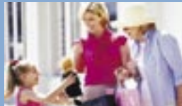
Shopping malls, stores, plazas and strip malls