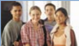
Schools, colleges and other educational facilities