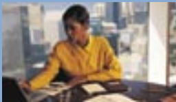
Commercial buildings including mixed-use facilities