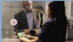
Banks and other financial institutions